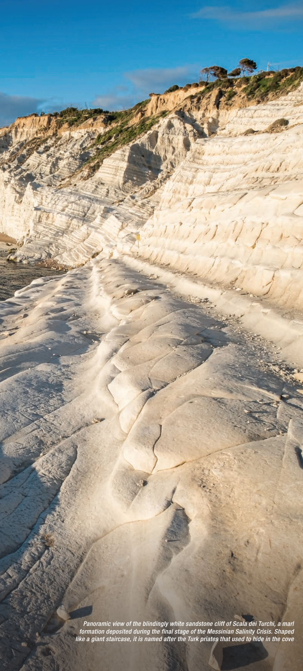
Panoramic view of the blindingly white sandstone cliff of Scala dei Turchi, a marl formation deposited during the final stage of the Messinian Salinity Crisis. Shaped like a giant staircase, it is named after the Turk pirates that used to hide in the cove

It was a drizzly, grey morning when I arrived in the suburbs of Paris, sluggish from catching the first Eurostar at the crack of dawn but excited for the challenge ahead. I navigated my way through the windy streets in search of IFP Energies Nouvelles (IFPEN) - a renowned research organisation specialising in applied geoscience for the energy industry, which houses a dedicated lab for physical analogue modelling.