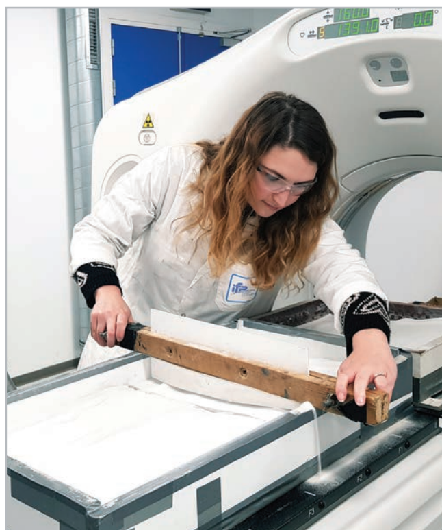
Analogue modelling in action: applying additional sand layers at certain time intervals during model runs (left), and ensuring even distribution of sand layers (right)

► waters of the Atlantic via a narrow passage through the Gibraltar Straits, but around 6 million years ago this connection was disrupted. The Med became an isolated body of water, and intense evaporation caused water levels to drop. As more and more water was evaporated the salinity of the remaining seawater increased, until salt started to precipitate and settle on the seafloor. This dramatic event is known as the Messinian Salinity Crisis, and it led to the deposition of the world's youngest salt giant – a thick unit of salt deposited across the Mediterranean basin.